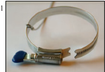
Open the jubilee clip and remove one of the wire loops.

The Le Maitre Fixing Clamp serves 2 purposes, first it is to hold the effect cartridge securely into the variable angle pod. The second use is to secure the cartridge and prevent the cartridge from ejecting from the angle pod when fired. It is imperative that the fixing clamp is used with all new style projection cartridges.