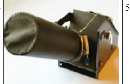
Open the jubilee clip and remove one of the wire loops.