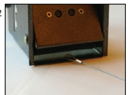
Place the wire loop under the main body of the variable angle pod.